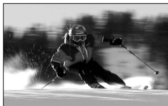
Taos Ski Academy