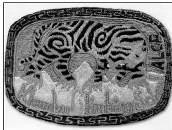
The Magic Knot