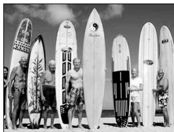
Surfing For Life