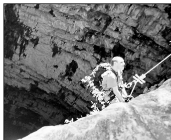
The Man Who Jumped Beneath the Earth