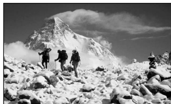
Women of K2