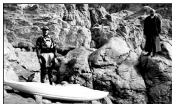
The Yunnan Great Rivers Expedition