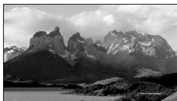
Torres del Paine