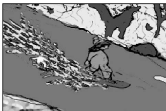
Brigit Saves Winter