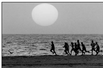
Blue Planet Run