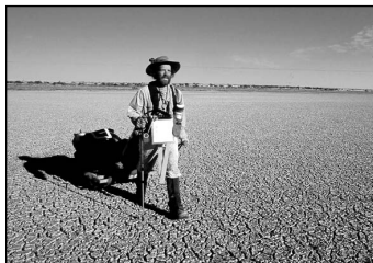
Alone Across Australia

A TALE UNFOLDS A young Hunza girl explores the Baltit Fort in Northern Pakistan and evokes its rich history in this gorgeously filmed piece. Imran Babur, Pakistan, 7 mins. 2000