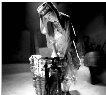
A Tale Unfolds

A TALE UNFOLDS A young Hunza girl explores the Baltit Fort in Northern Pakistan and evokes its rich history in this gorgeously filmed piece. Imran Babur, Pakistan, 7 mins. 2000