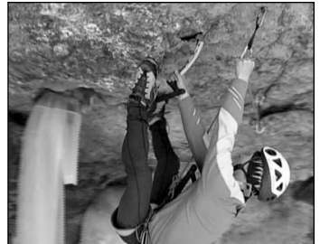
Ice Axis - Disco