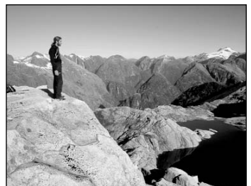
In Shadow of the Condor