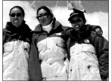
Daughters of Everest