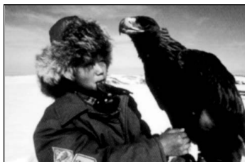
Le Seigneur des Aigles