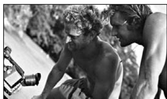
ZEN AND ZERO