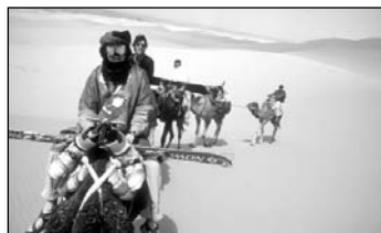
ACROSS THE ATLAS