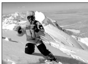
SHISHA IN WINTER