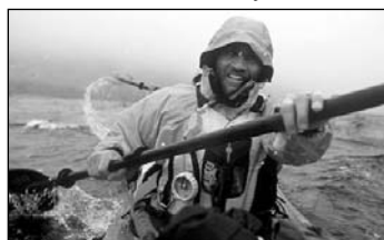
BIRTHPLACE OF THE WINDS