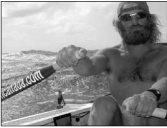
BEYOND THE HORIZON