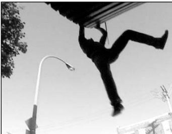
THE DIST URBAN BEHAVIOUR