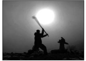
BALANCING POINT 1